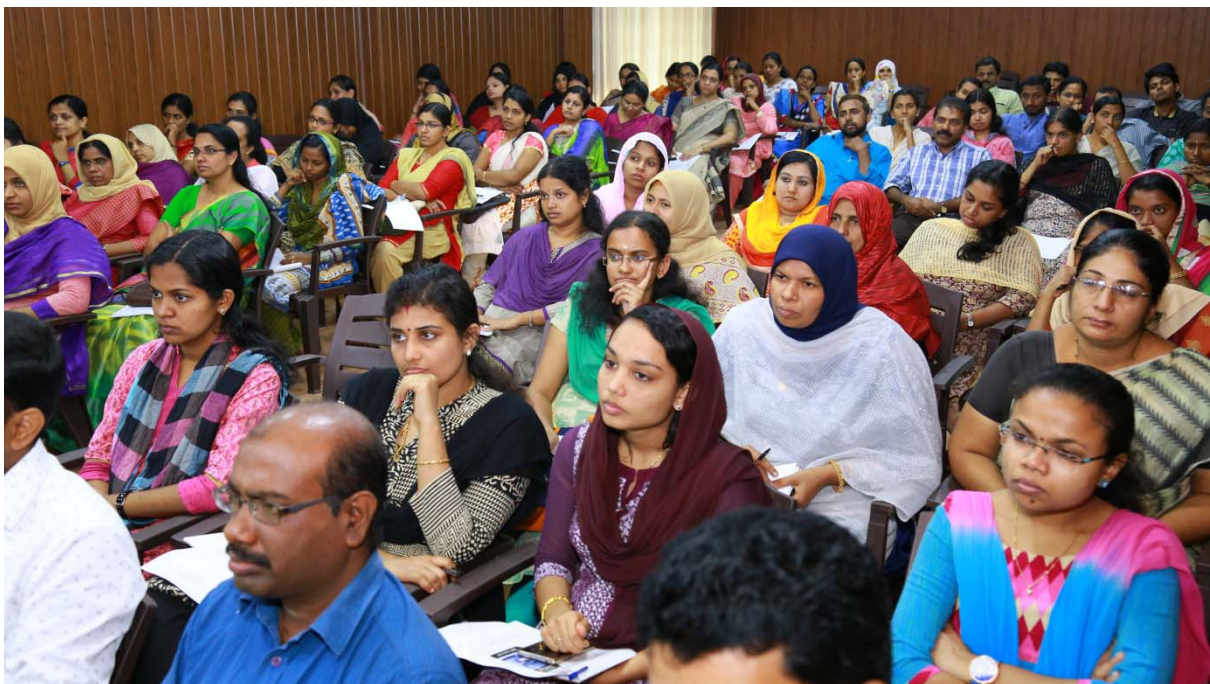
Participants of the Two day workshop on Research Methodology: Practices and Updates