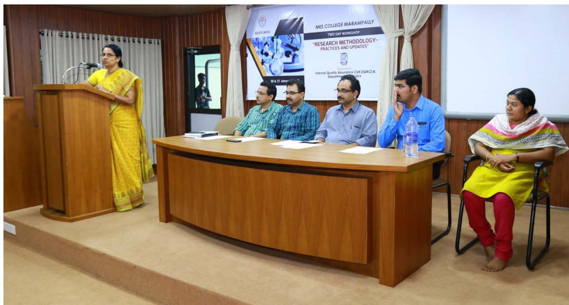
Valedictory Session of Two day workshop on Research Methodology: Practices and Updates