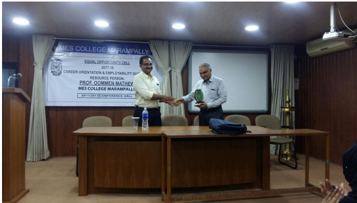
The team behind....