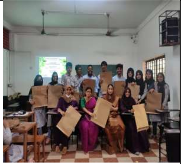
Workshop on Paper Bag making