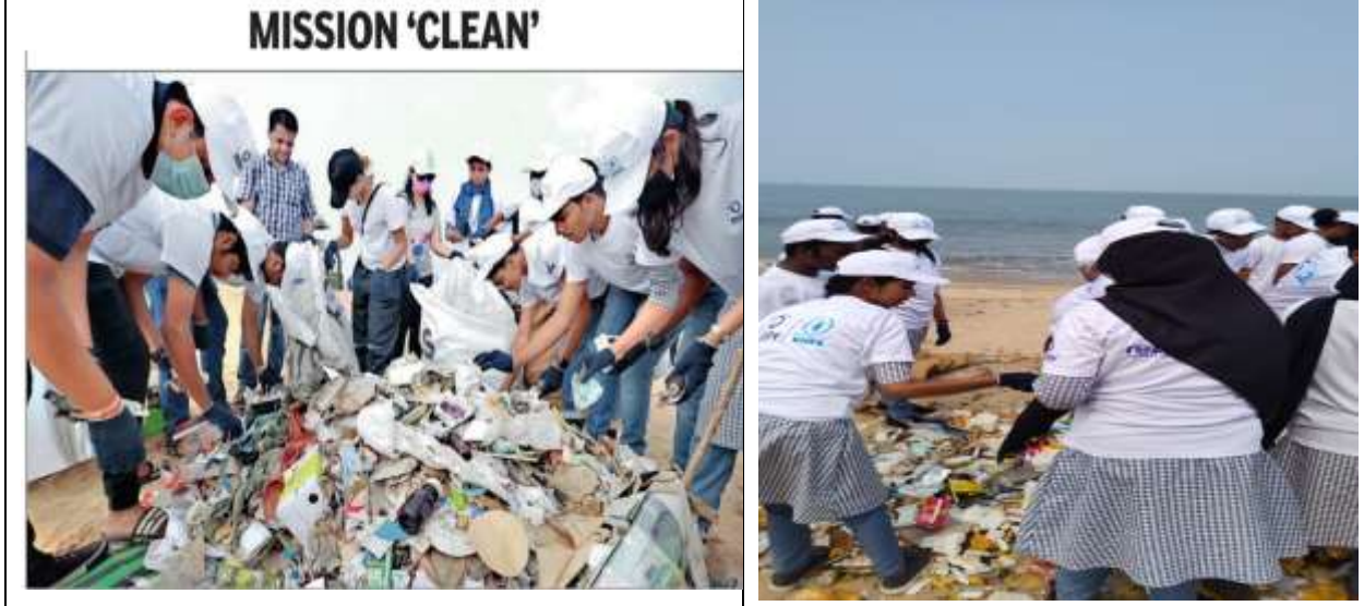
Event 10: Beach Cleaning Activity 31-03-2022 Canopy Nature club volunteers participated in the beach cleaning activity organized by Kerala Hotels and Restaurant's Association (KHRA) at Puthuvype beach on 31 st March 2022. About 20 students volunteers of the Nature club actively participated in the programme.

സോഷ്യലൈസേഷൻ യൂണിറ്റ് ഫൗണ്ടേഷൻ, എം.ഇ.എസ് കോളേജ് നേപ്പർ ക്ലബ്ബ് എന്നിവയുടേയും നാഷണൽ സർവീസ് സ്കീമിന്റെയും സഹകരണത്തോടെയാണ് പരിപാടി സംഘടിപ്പിച്ചത്. വാഴക്കുളം പഞ്ചായത്തിലെ മുഴുവൻ വീടുകളിലും ശുദ്ധജലം എത്തിക്കുക, ജുജല സംരക്ഷണം, മഴവെള്ള സംഭരണം, മലിനജല