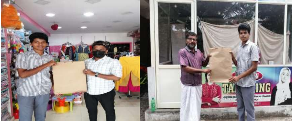
Distribution of paper bags