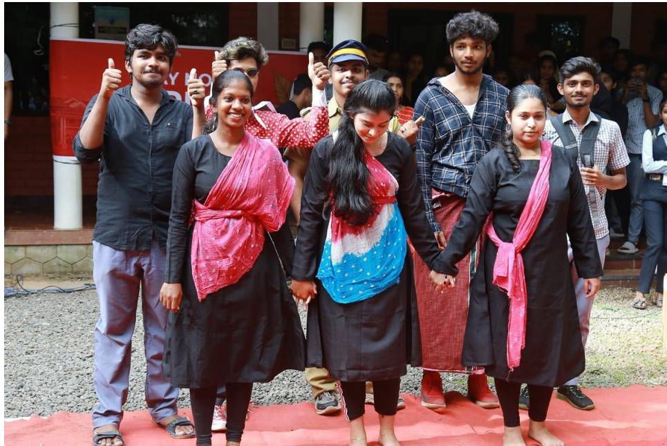
Street play in the college campus on 25 June 2022