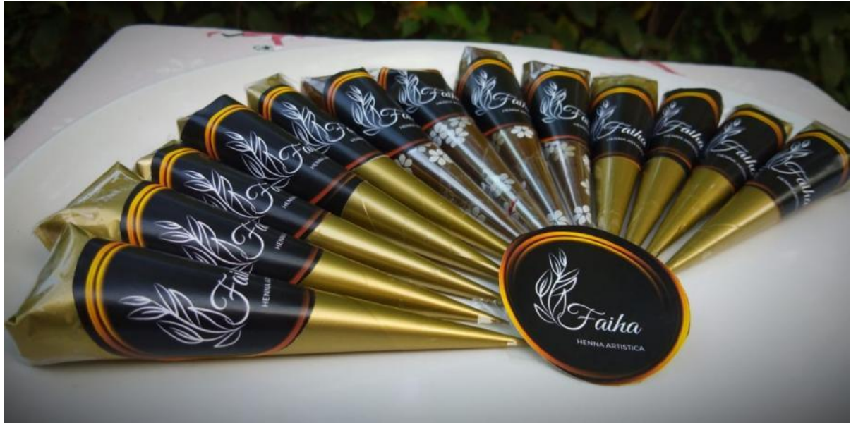
New startup venture of S4 BCom student Mirza Aboobaker, bridal blend henna cone 100% pure organic henna