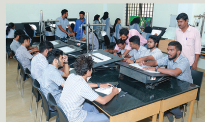
2D Animation Lab