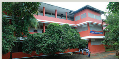
EK Abdul Khader Sahib Memorial Block