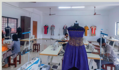
Garment Construction Lab

College Buses are available from Aluva, Charanallore, Edvanakad, Kodungallur, Kakkanad, Thrippunithura, Paravoor, Kaloor, Vyttila, Nettoor, Chalakudy, Athani, Kothamangalam, Muvattupuzha and Perumbavoor.