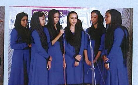
PG DAY CELEBRATIONS