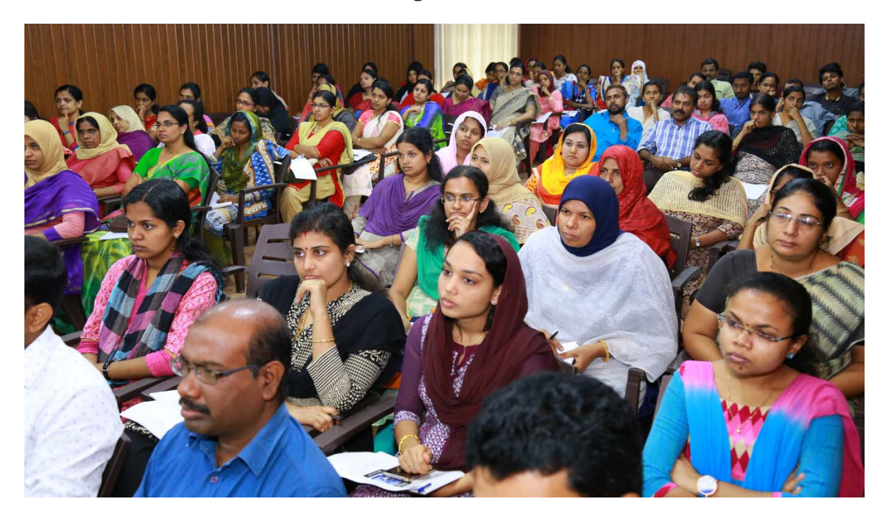
Participants of the Two day workshop on Research Methodology: Practices and Updates