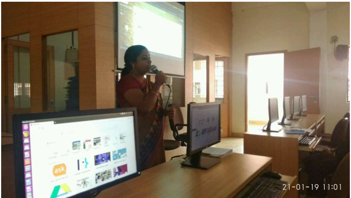
Hands on training session