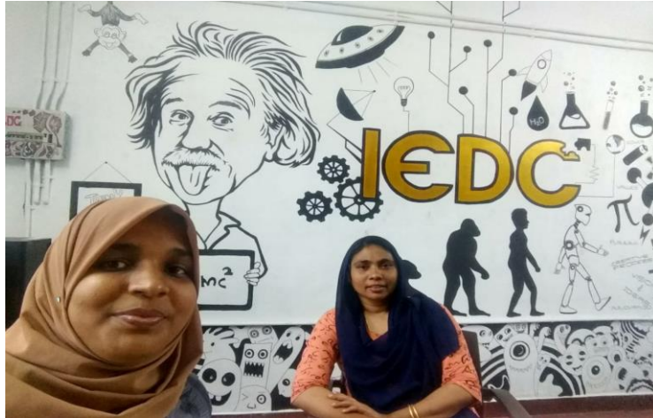
Nodal Officers Meet at KINFRA