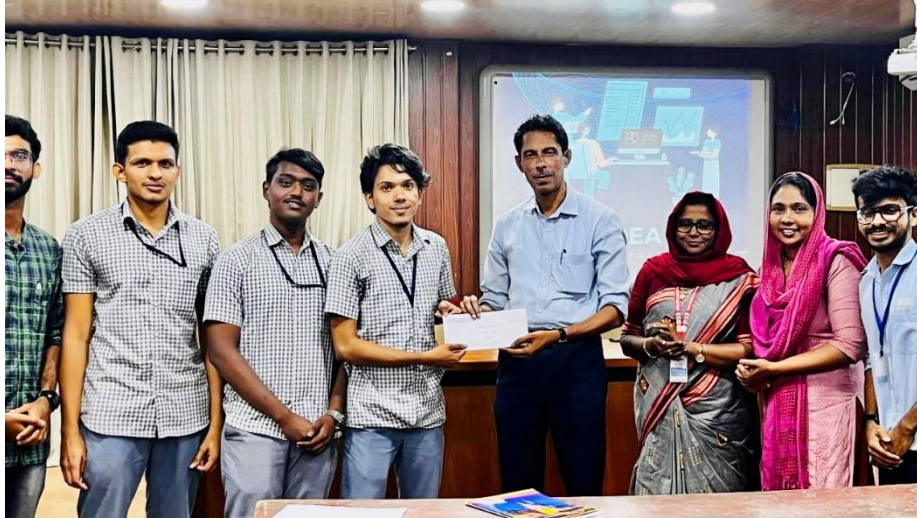
Team 2 won second prize Rs. 2000/-.