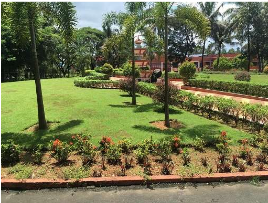
FIGURE 1: MES COLLEGE CAMPUS

The College offers 12 UG Programmes such as Computer Applications (BCA), B.Sc. Electronics, Business Administration (BBA), and B.Com. (Model II), B.Com. (Taxation), B.Sc. Biotechnology, B.Sc. Microbiology, B.Sc. Physics (Model II) B.Sc. Mathematics (Model II), B.A. English, (Three Main) B.A. Arabic (Model II), B.Sc. Psychology, B. Voc. Logistics Management, B. Voc. Animation & Graphic Design, B. Voc. Software Development & System Administration, B. Voc. Fashion Designing & Management and B. Voc. Industrial Instrumentation & Automation and 10 Post Graduate programmes viz. M.Sc. Biotechnology, M.Sc. Electronics, M.Com. M.Sc. Microbiology, M.Sc. Biochemistry, M.A. English Language and literature, M.Sc. Computer Science, MHRM and M.Sc. Physics and Msc Psychology. Along with college conducting 7 vocational programmes, 01 integrated programmes and 27 certificate courses.