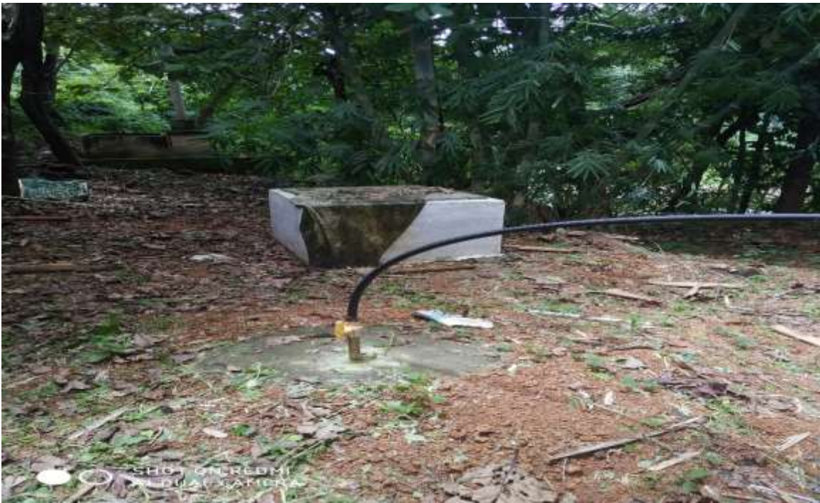
FIGURE 2: BIO GAS PLANT

Biogas is a renewable, as well as a clean, source of energy. Gas generated through bio digestion is non-polluting; it actually reduces greenhouse emissions. No combustion takes place in the process, meaning there is zero emission of greenhouse gasses to the atmosphere; therefore, using gas from waste as a form of energy is actually a great way to combat global warming. Another biogas advantage is that, unlike other types of renewable energies, the process is natural, not requiring energy for the generation process. In addition, the raw materials used in the production of biogas are renewable.