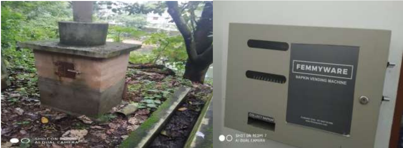
FIGURE 4: INCINERATOR IN COLLEGE AND LADIES TOILET