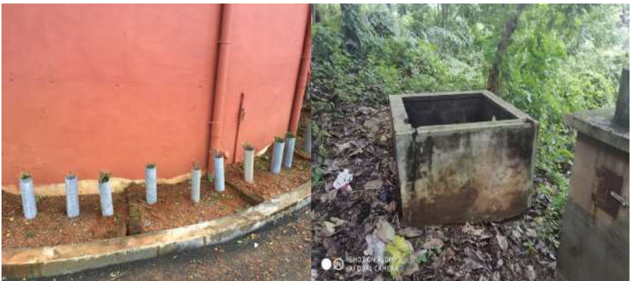
Figure 3 VERMICOMPOST PLANT

Pipe composting is a kind of vermicomposting often called as worm tube composting which is carried out by using PVC tube. This is a simpler method for treating wastes of lower volume.