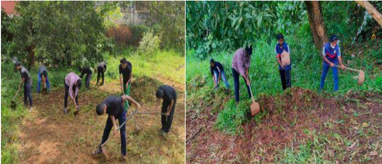
FIGURE 5: CAMPUS CLEANING DRIVE

College ground and surroundings to increase the interest in physical activities and creating a healthy and hygienic surroundings..