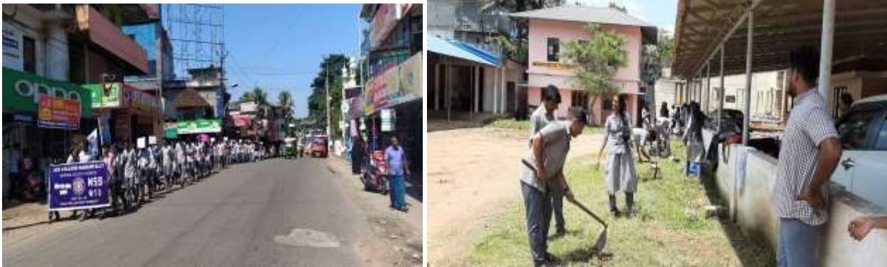
FIGURE 5: CAMPUS CLEANING DRIVE