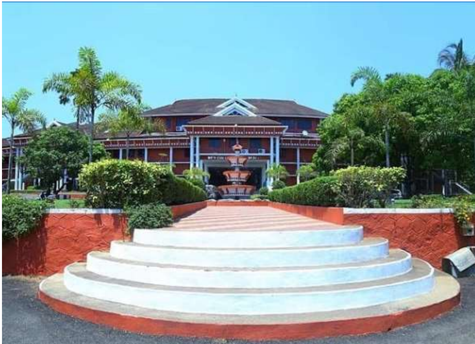
FIGURE 1: MES COLLEGE CAMPUS

Biochemistry, M.A. English Language and literature, M.Sc. Computer Science, MHRM and M.Sc. Physics.