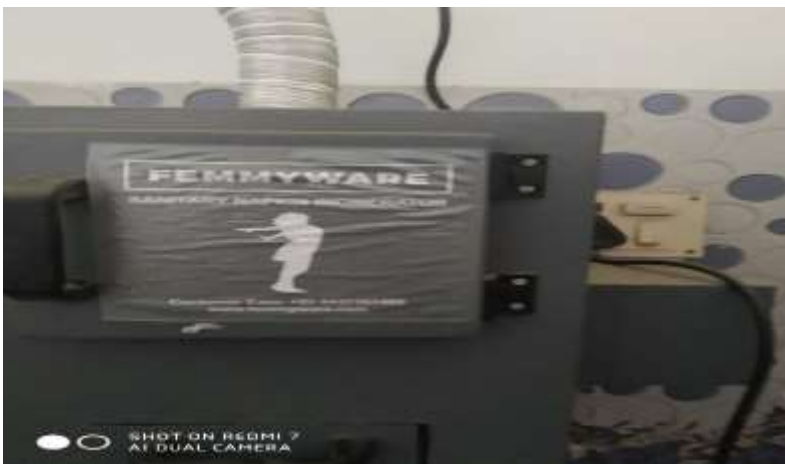
Figure 4: Portable incinerator in Ladies Toilet