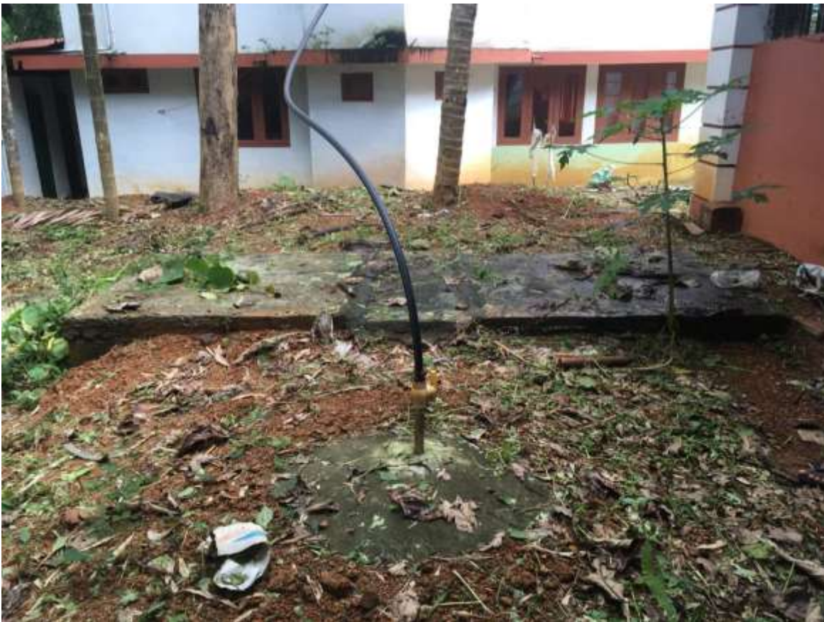
FIGURE 2: BIO GAS PLANT

Biogas is a renewable, as well as a clean, source of energy. Gas generated through bio digestion is non-polluting; it actually reduces greenhouse emissions. No combustion takes place in the process, meaning there is zero emission of greenhouse gasses to the atmosphere; therefore, using gas from waste as a form of energy is actually a great way to combat global warming. Another biogas advantage is that, unlike other types of renewable energies, the process is natural, not requiring energy for the generation process. In addition, the raw materials used in the production of biogas are renewable.