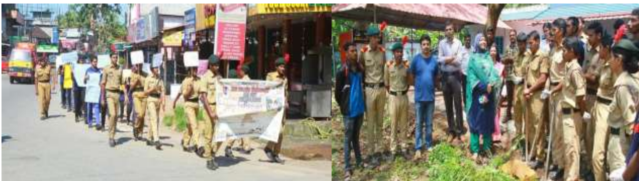
Figure 6: Gandhi Jayanthi Day Celebrations