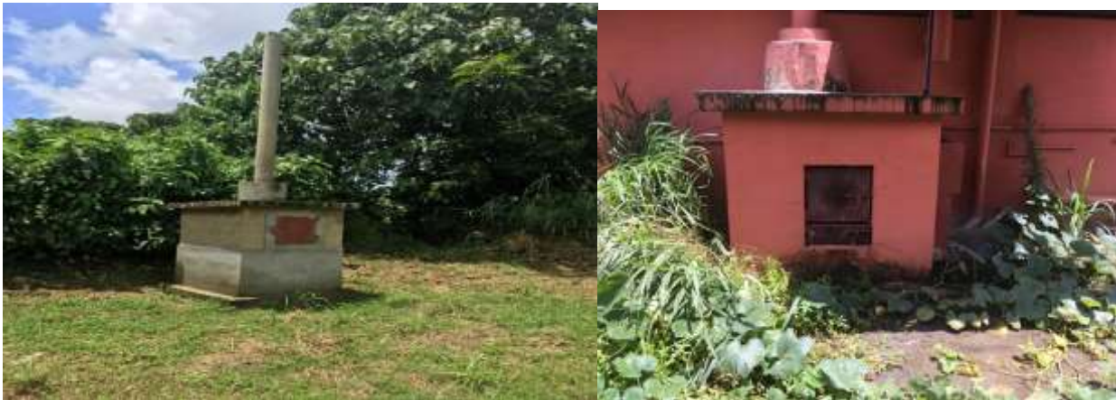
Figure 3: Incinerator in college and Hostel