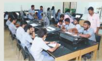
2D Animation Lab