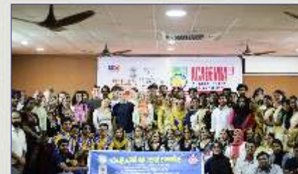
Cultural Exchange Programme