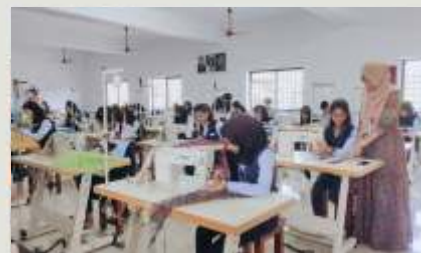
Garment Construction Lab