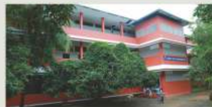
EK Abdul Khader Sahib Memorial Block